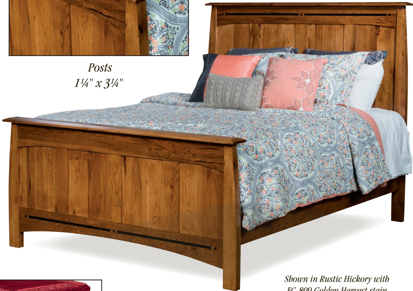
Shown in Rustic Hickory with FC-809 Golden Harvest stain