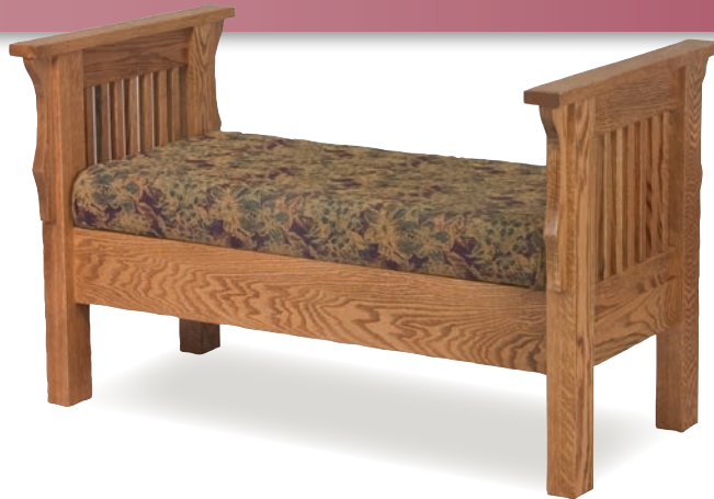
075-PBS Panel Bed Seat