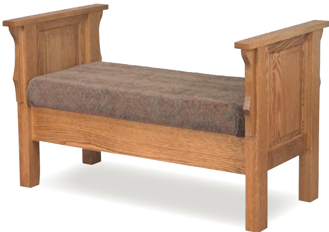
057-BCBS Boulder Creek Bed Seat