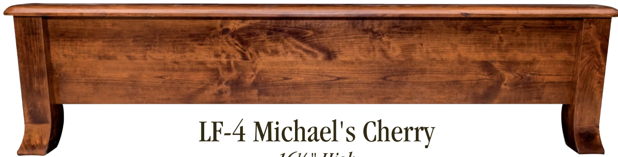
LF-4 Michael's Cherry 16½" High