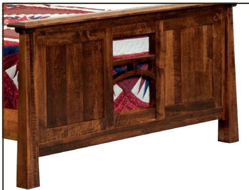
Detail of optional cut-out