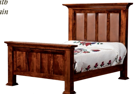
Shown with Leather Panels