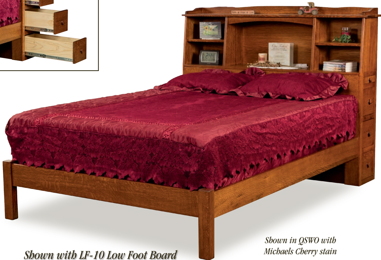
Shown with LF-10 Low Foot Board