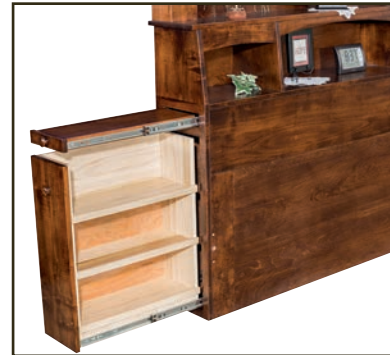
Option Pull Out Shelf