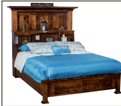
Shown with 014 Storage Foot Board