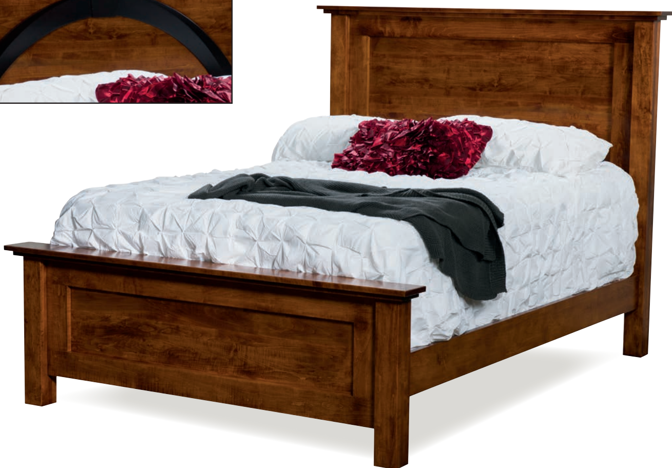
Shown in Brown Maple with Michaels Cherry stain. Arch: Onyx