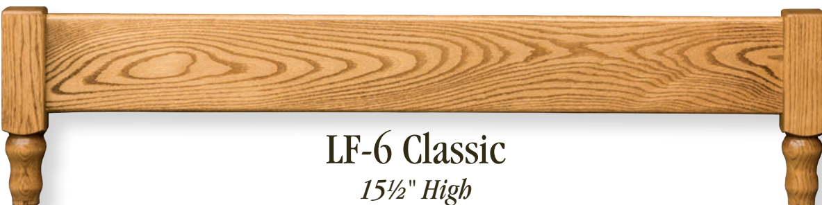
LF-6 Classic 15½" High