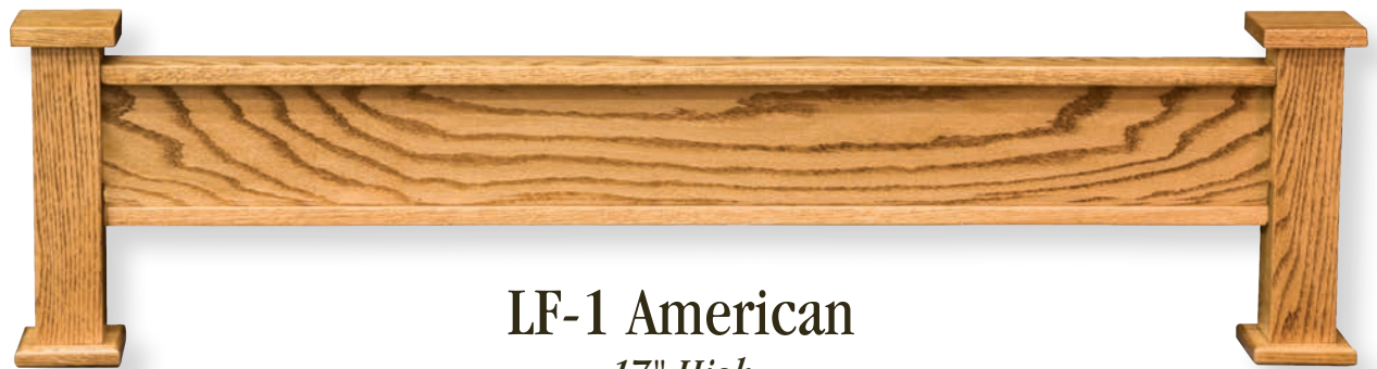
LF-1 American 17" High