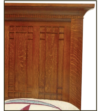
Optional mullion inserts.