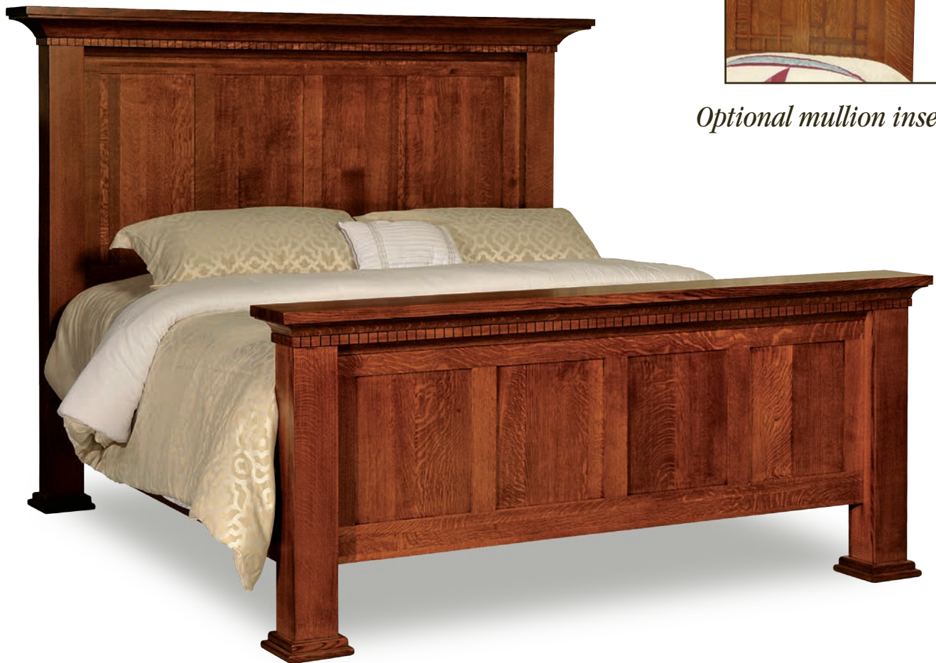
Shown in QSWO with Michaels Cherry stain