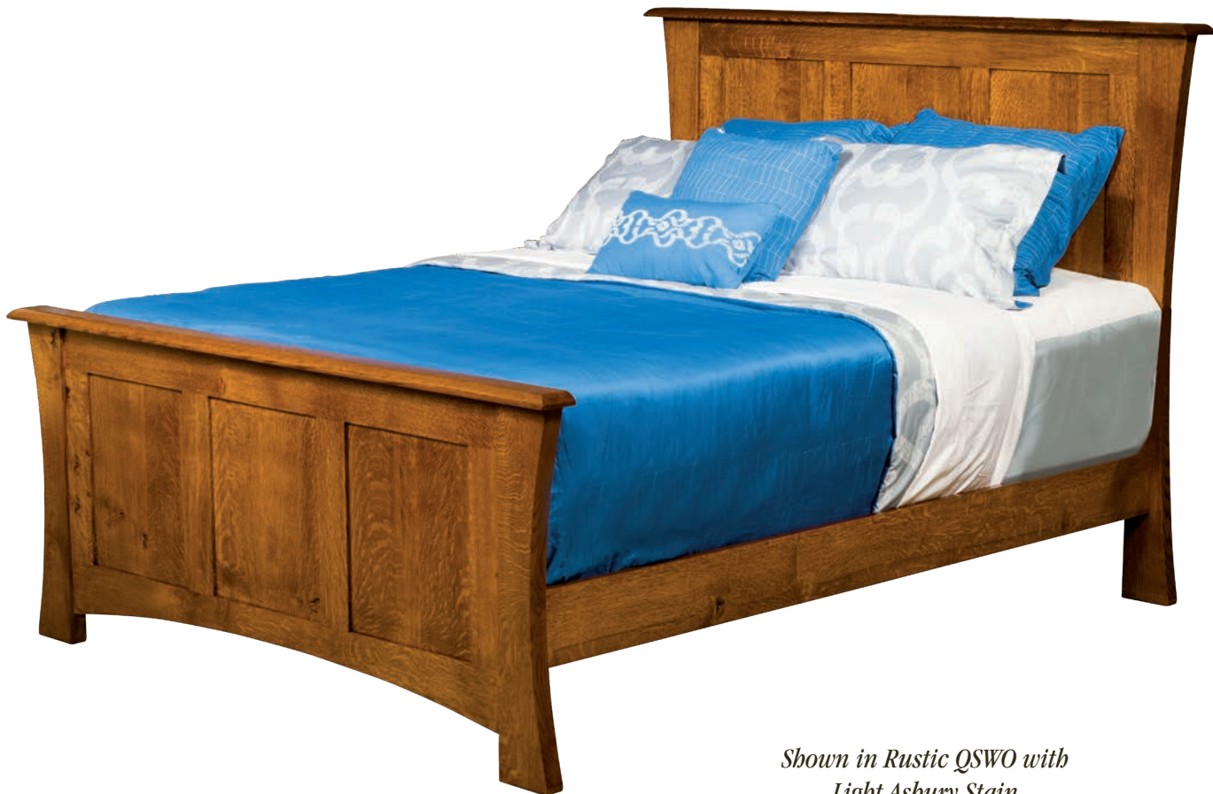
Shown in Rustic QSWO with Light Asbury Stain