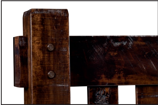
Headboard Detail True Mortise and Tenon/Wood Pins