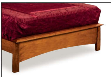
Shown with matching low footboard. 16½" High