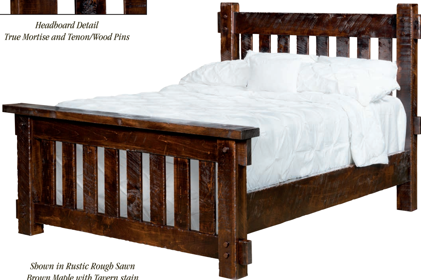
Shown in Rustic Rough Sawn Brown Maple with Tavern stain