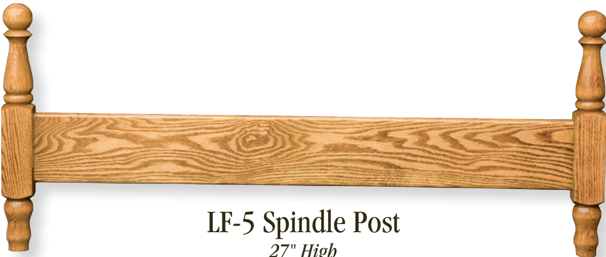
LF-5 Spindle Post 27" High