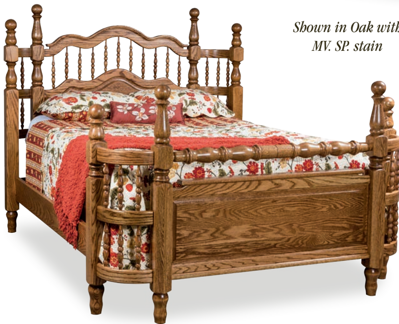
Shown in Oak with MV. SP. stain