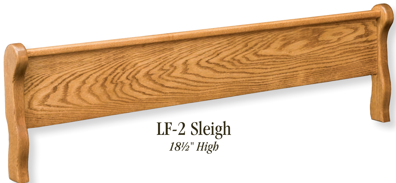
LF-2 Sleigh 18½" High