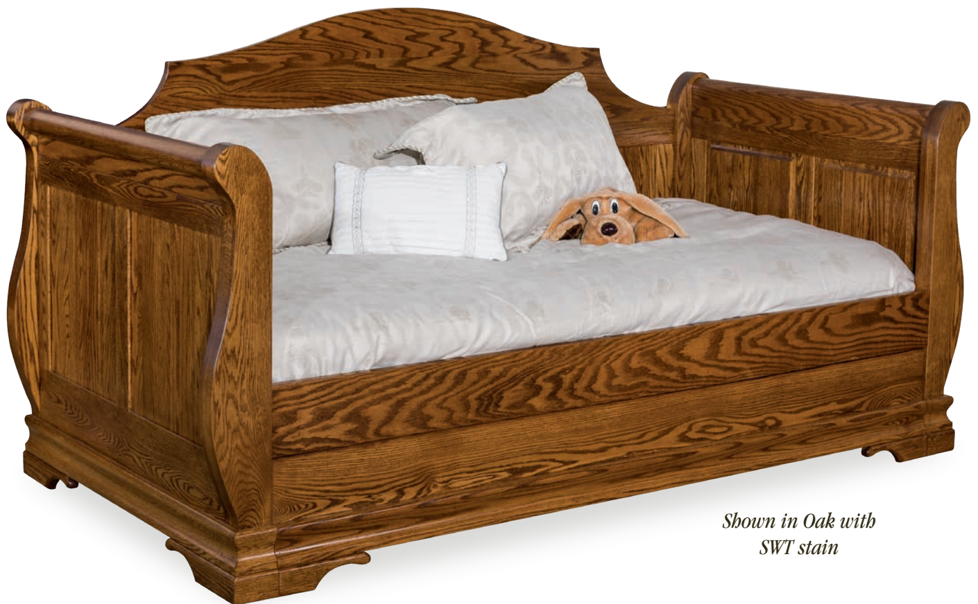
Shown in Oak with SWT stain