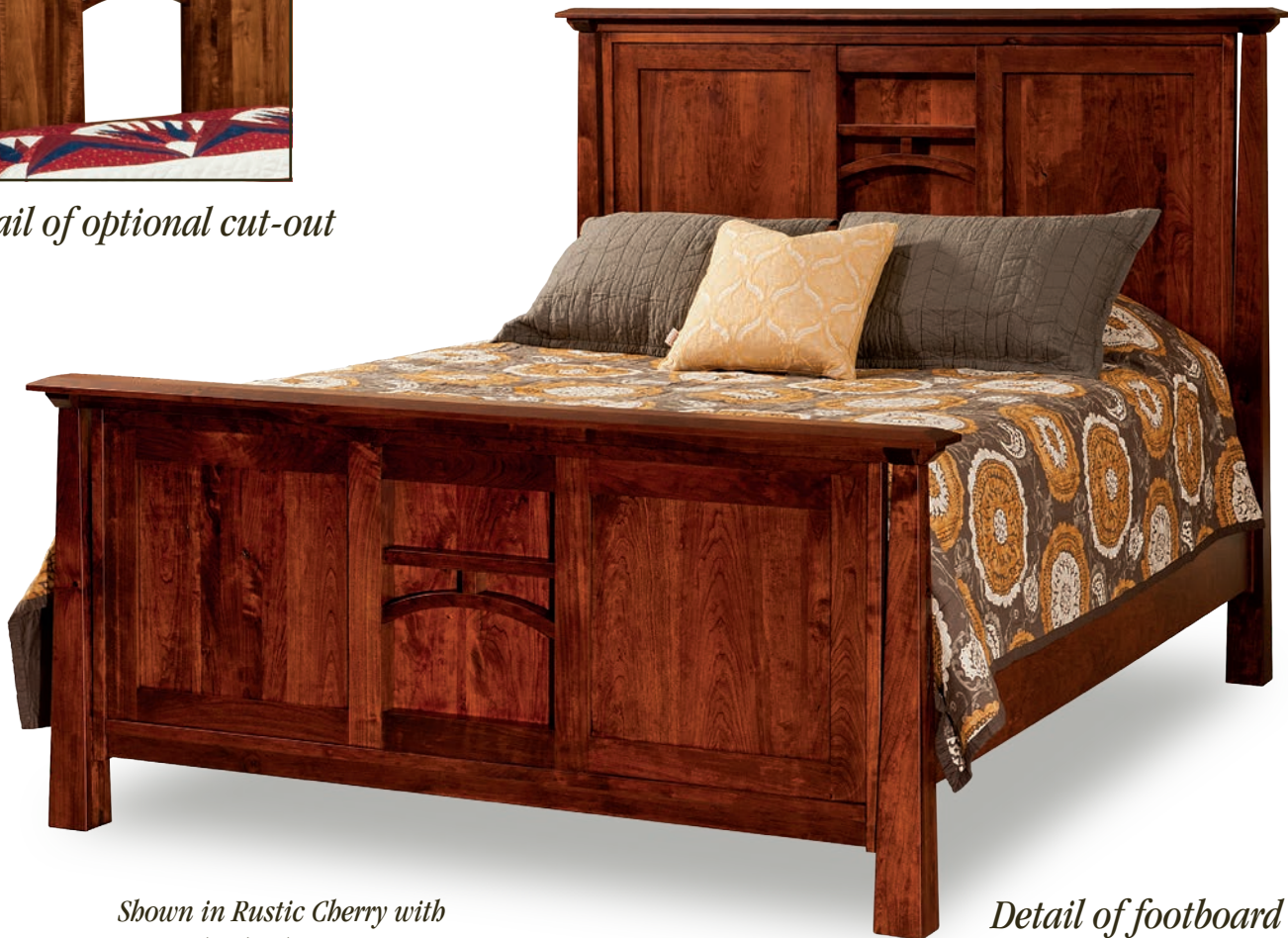
Shown in Rustic Cherry with Michaels Cherry stain