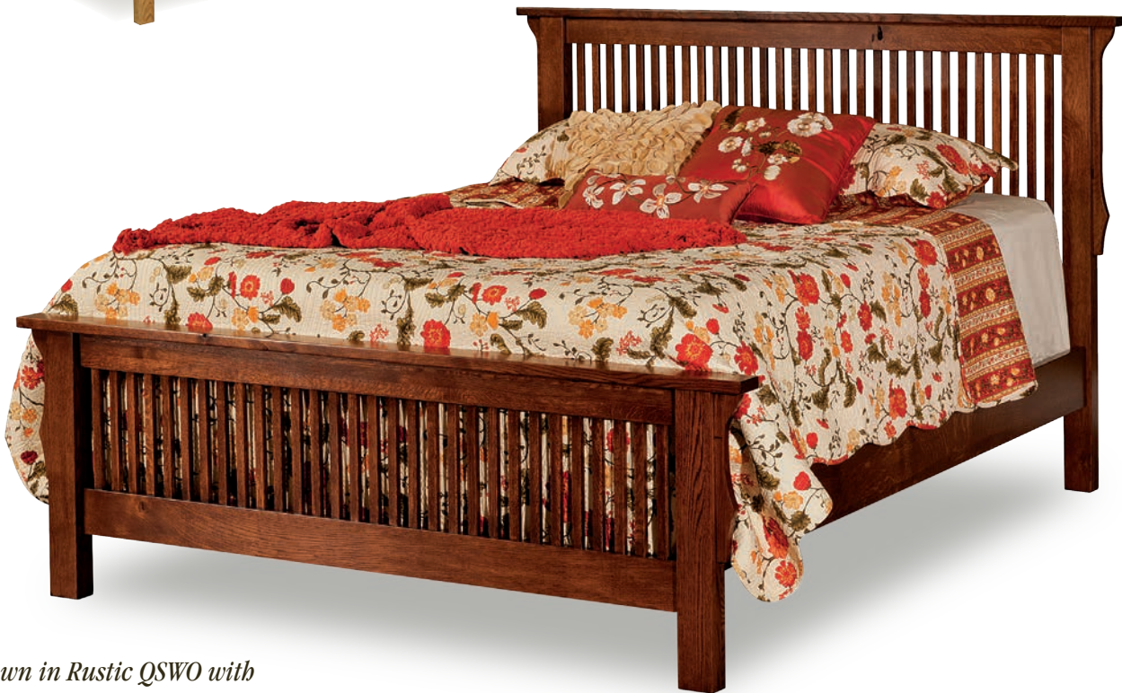
Shown in Rustic QSWO with Golden Brown stain