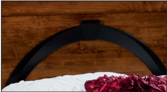
Optional Arch in Headboard