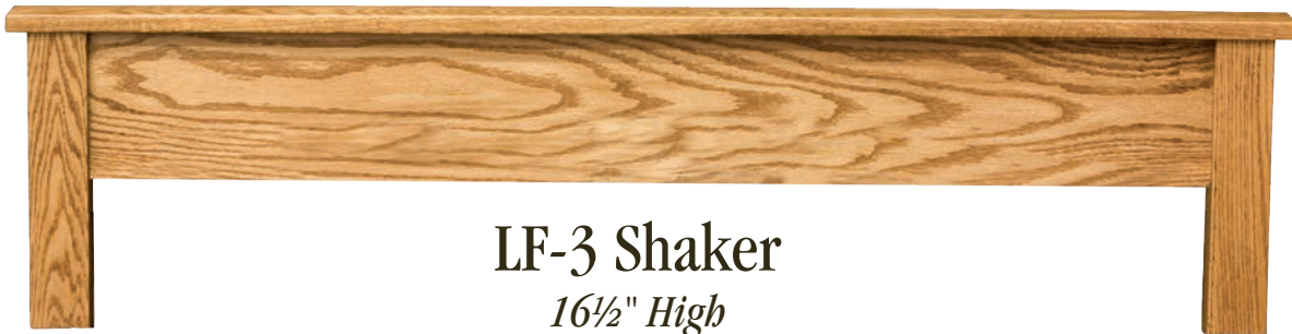
LF-3 Shaker 16½" High