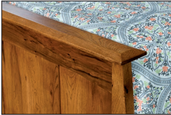
Posts 1¼" x 3¼"