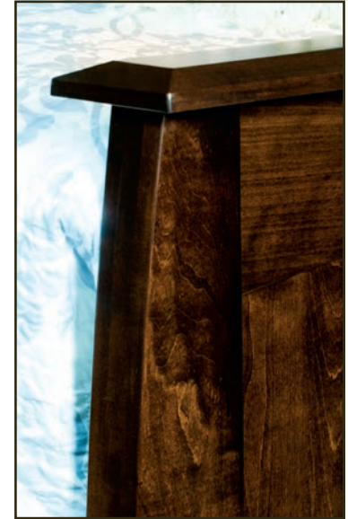
Wider, Thicker Posts 2 \frac{1}{4} " x 4 \frac{1}{4} "