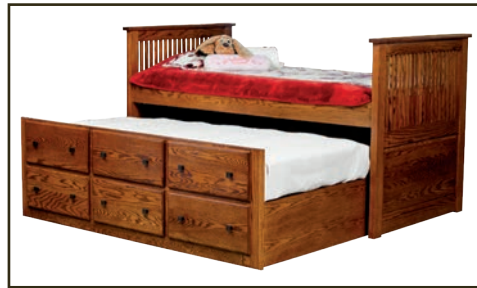
Standard with storage behind drawers. 3 working drawres on bottom. Top drawers are fake.