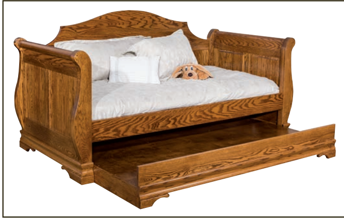
Shown with Trundle