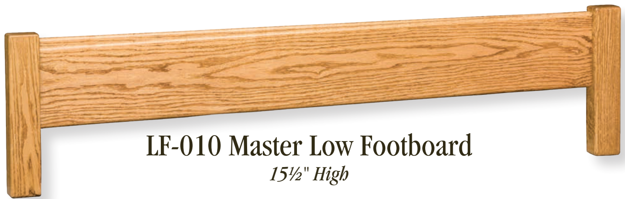
LF-010 Master Low Footboard 15½" High