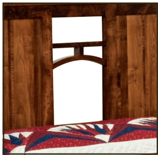
Detail of optional cut-out