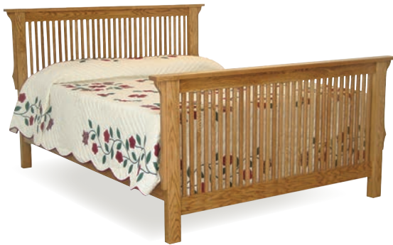
070 in Oak