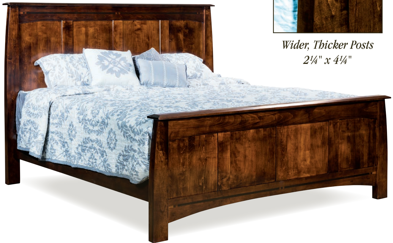
Shown in Brown Maple with Rich Tobacco stain